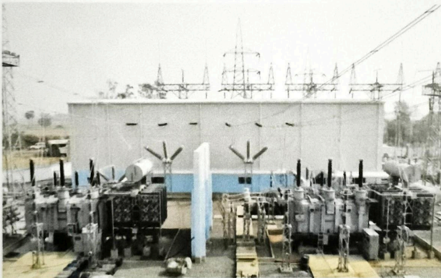
Figure: -Power Transformer