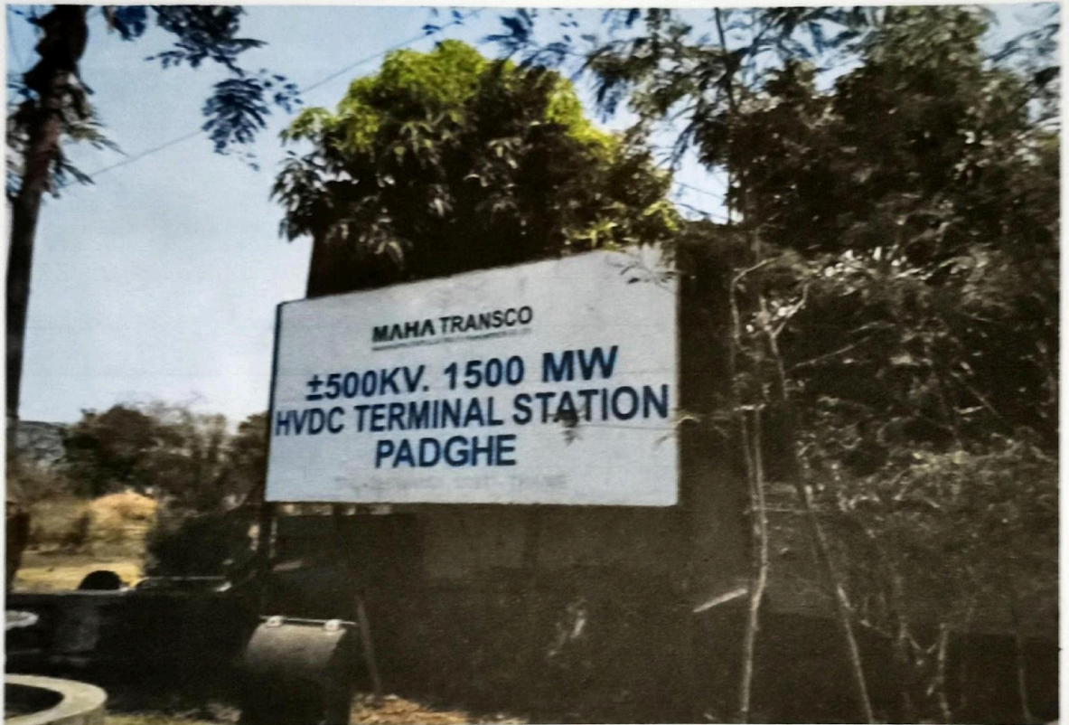
Figure: -HVDC SUBSTATION PADGHE

The Maharashtra State Electricity Board (MSEB) built a 1,500 MW HVDC link between the cities of Chandrapur and Padghe (near Mumbai) – the first HVDC transmission link to Mumbai. The converter terminals were constructed by ABB (Sweden and India) and Bharat Heavy Electricals Limited (BHEL) of India. The 500 kV Chandrapur – Padghe HVDC Bipole feeds Mumbai on the west coast with 1,500 MW from a thermal power generation plant located near Chandrapur in the eastern part of Maharashtra State 752 km away. The link helps to stabilize the Maharashtra grid, increasing power flow on the existing 400 kV AC lines while minimizing total line losses.